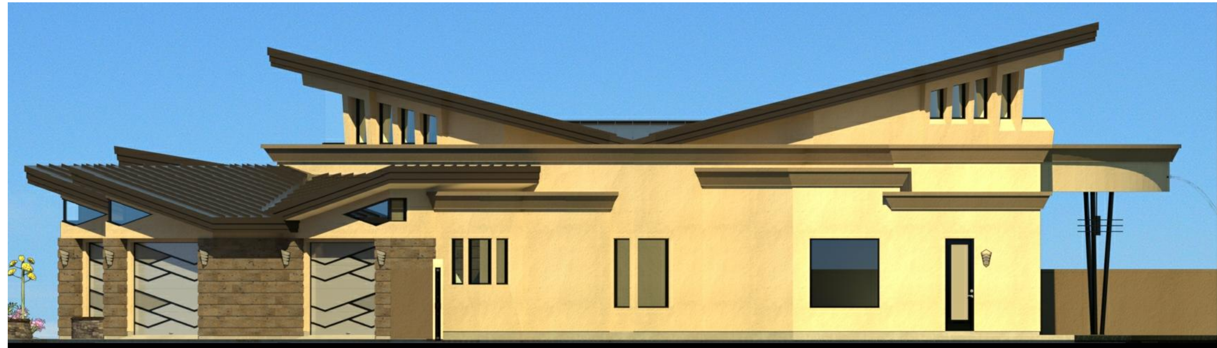
Right (West) Elevation